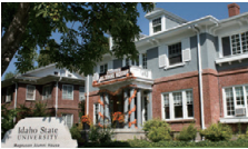
Idaho State University