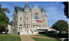
Virginia Union University