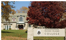
Rhode Island College