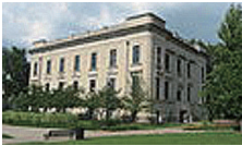
Indiana State University