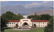
New Mexico State University