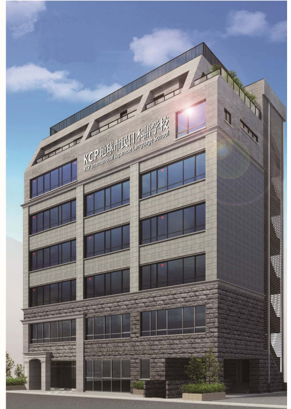
KCP Campus in the heart of Tokyo