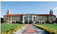
Texas Tech University